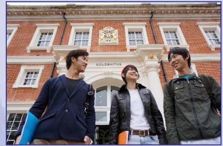
Students of the Faculty of International Liberal Arts studying at Goldsmiths, University of London

Established in FY2014, the Faculty of International Liberal Arts allows students to graduate after taking only courses given in English. The faculty requires students to study abroad for about one year from the second semester of their first year to the United States, the United Kingdom, Canada, and Australia. In FY2015, including these students, total of 971 Japanese students (12.4% of all Soka University students) studied abroad.