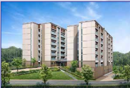
International Student Dormitory to accommodate Japanese and foreign students (Scheduled for completion in spring 2017; Artist's impression of the building for male students)

As of May 2016, 447 foreign students (5.6% of all Soka University students) from 47 countries/territories on five continents are studying at Soka University. To further enhance this environment, in which foreign and Japanese students study together, a new International Student Dormitory is planned, in addition to the current one, which houses 100 male and 100 female students. Accommodating 400 male and 144 female students, the new facility will be completed in the spring of 2017. The new dormitory will accept both Japanese and foreign students to encourage the development of their intercultural communication skills.