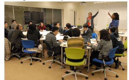
〈 Short-term FD program on campus 〉

In fiscal 2014, we sent 1 faculty to Teachers College, Columbia University for one semester, and held specialized classes to the local students in English. In addition, for the purpose of improving their skills in teaching to non-English students, we conducted a short-term FD program on campus in which we invited two lecturers from the University of Southern California, and 17 faculty participated in the program.