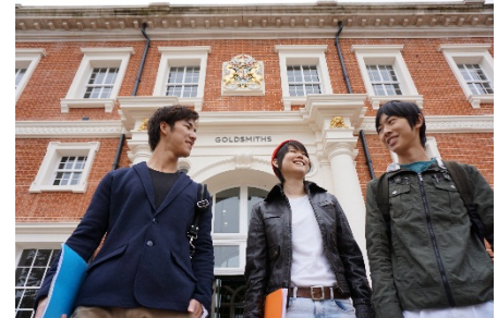
〈 Students of Faculty of International Liberal Arts studying at London University, Goldsmiths 〉

We aim to increase the number of students with overseas experience to 80% of the entire undergraduate students, and students earning credits in overseas universities to 1260 students by fiscal 2023. In fiscal 2014 there were 933 students studying abroad, which includes 78 students in the Faculty of International Liberal Arts (FILA), a newly established faculty where students can graduate by only taking lectures in English. FILA students study abroad for one year from their second semester to four universities in the U.S., U.K., Canada, and Australia, and about 20 students study at each destination respectively. From this fall semester, they are scheduled to take specialized courses in English.