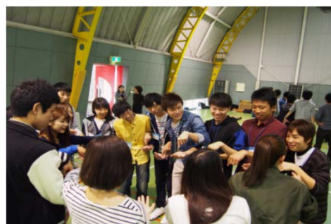
〈 Project adventure study session of Active Learning 〉

Established in year 2000, Center for Excellence in Teaching and Learning has took the lead in promoting collaborative learning and FD programs at Soka University. The achievements being acknowledged, Soka University was selected for the AP Project in fiscal 2014. In this AP Project, we will enrich the quality of our active learning, and through visualizing the achievements and putting efforts in the assessment process, we will implement active learning in 80% of the entire courses. All students will then register for at least 4 classes that implement active learning. With the campus-wide development of active learning, Active learning style such as "Learning Through Discussion (LTD)" and "Project Based Learning (PBL)" have been promoted campus-wide. This has improved the international competency of the bachelor's degree program at Soka University.