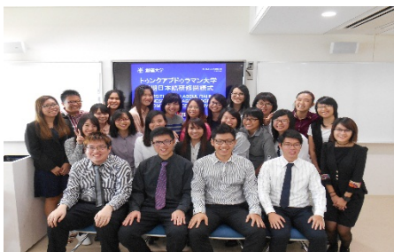
〈 Participants of Japanese language and culture study program from Malaysia 〉